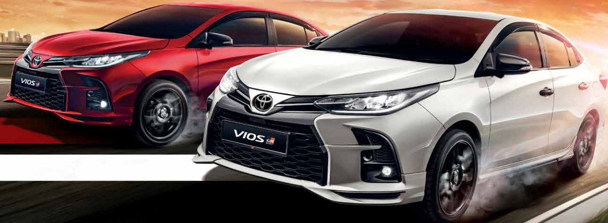
Red Mica Metallic (3R3)